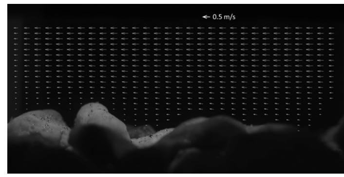
Figure 7: Velocity field from particle image velocimetry representing critical flow conditions, i.e. onset of rolling motion of the explosive chunks. The velocity field was averaged over 319 instantaneous velocity fields covering a period of 2 s.

As part of the test munition clearance work in the Immediate Action Program, the Explosive Ord-nance Disposal (EOD) companies Eggers GmbH and Hansataucher GmbH recovered small fragments of exposed explosive material from the WWII-era Pelzerhaken munition dumpsite in Lübeck Bay and transferred them to the Schleswig-Holstein state EOD specialists (Kampfmittelräumdienst, KRD S-H).