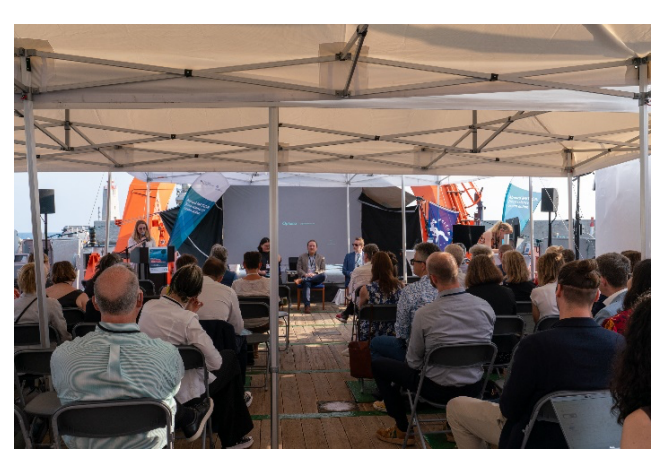
Figure 8: Panel discussion on the working deck of RV METEOR .

Afterwards, participants were able to learn about various aspects of marine munition, such as the detection of munitions in the sea, legal aspects,