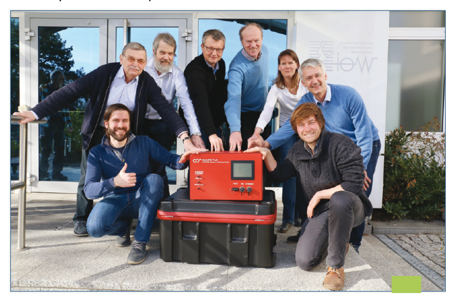
Figure 3: Members of BONUS PINBAL on the final meeting in Warnemünde, with the latest version of the flow injection spectrophotometric pH measurement system in the centre .

The instrument can be run on a continuous water supply as well as in a discrete sample mode. The measurement principle is identical in both cases, with a pre-set number of measurements foreseen in the discrete sample mode. In both cases, a dark and a blank spectrum is recorded before each injection of indicator dye into the sample water.